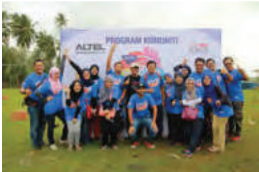
Raikan Hero Hero Malaysia (Altel) Teluk Renjuna Tumpat Kelantan (26 January 2016)